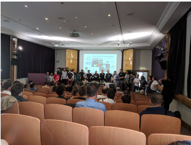
The organisers and helpers