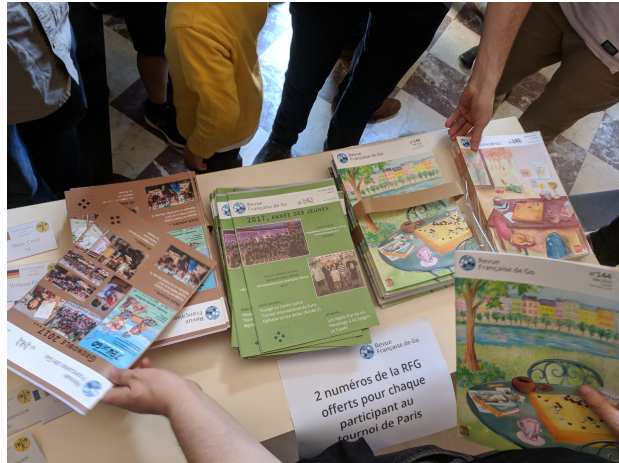
Optional hardcopy Go magazine