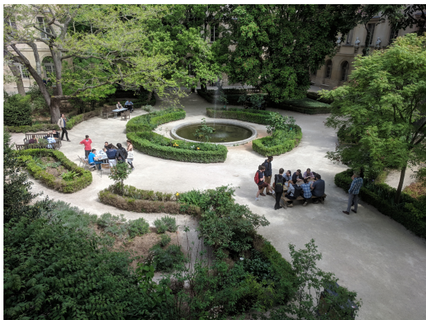
View of the central courtyard