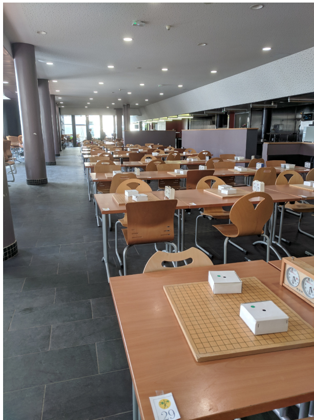
Main playing room in the Canteen