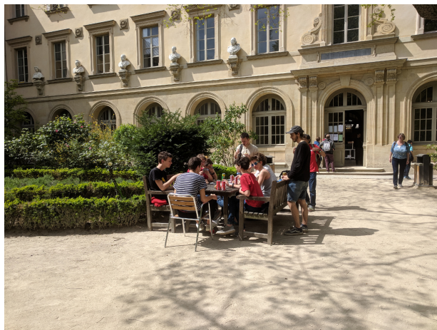
Players relaxing after round 3

(This document was constructed in html and then printed to pdf. Images are mostly 1224 pixels wide so you will see more detail if you expand the document to the width of the screen)