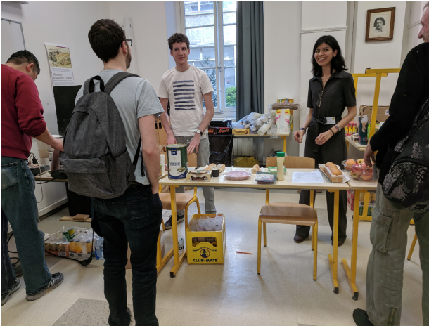
An army marches on its stomach