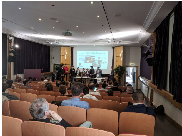
Youth prize giving