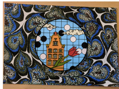
Flyer for 2019 Amsterdam tournament May 29 - June 02